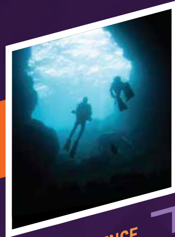
EXPERIENCE DEEP SEA WITH SNORKELING