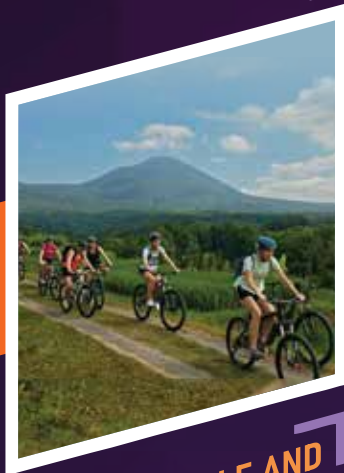
RIDE A BICYCLE AND SUPER BIKE TO GREENERIES