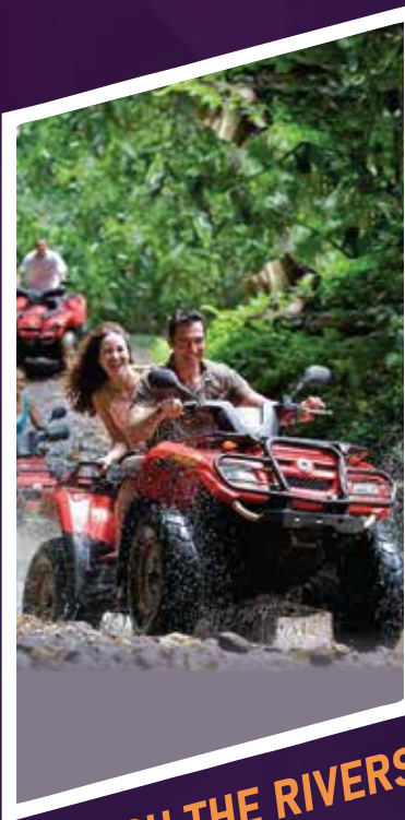
SPLASH THE RIVERS WITH ATV RIDE