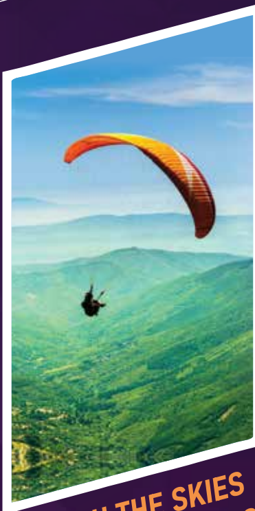
TOUCH THE SKIES WITH PARAGLIDING