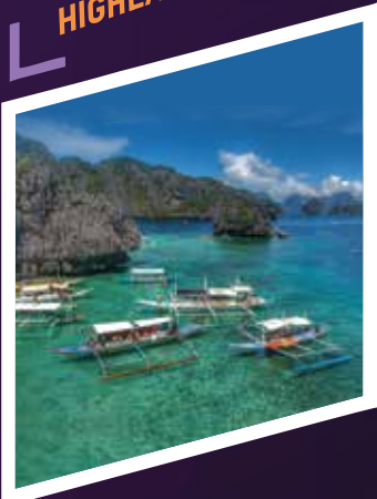
BREATH FRESH AIR ON HIGHLAND HOPPING